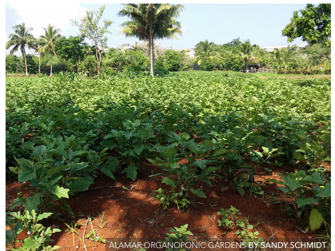
ALAMAR ORGANOPONIC GARDENS

This morning take a guided walking tour of Old Havana, a UNESCO World Heritage Site. Discover the four “plazas” in Old Havana: Plaza de la Catedral, Plaza Vieja, Plaza de San Francisco de Asis, and Plaza de Armas. Learn about the ongoing restoration projects throughout Havana, and see the giant model of the city. After lunch at Hemingway’s Old Havana favorite — Sloppy Joes — enjoy a private performance of Danza-Teatro Retazos. This incredibly talented group of dancers and their instructor will amaze and delight you, as they have been doing for audiences not only in Cuba, but internationally in the US and Europe. This evening, dine at the private restaurant La Guarida, which is the location of the Cuban Oscar-nominated film “Strawberry and Chocolate.” Overnight at Meliá Cohiba or similar (BLD)